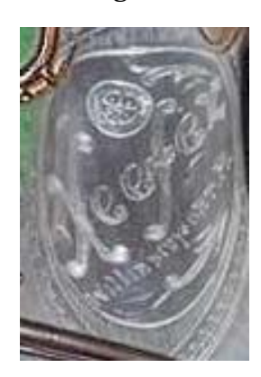
Style 6: Eagle and keystone with Keefer and large K [possibly by Arthur Magliocco]