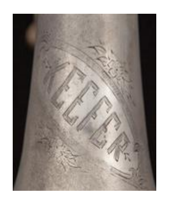
Style 5: swirl logo with Keefer in center [possibly by Arthur Magliocco]