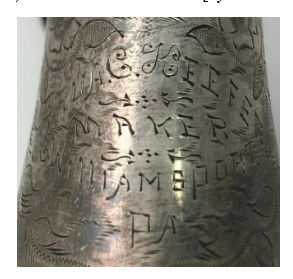
Style 2a: Same letters as 2 but now with a diamond pattern Keefer name. Used in mid-1920s. [Charles Otto]