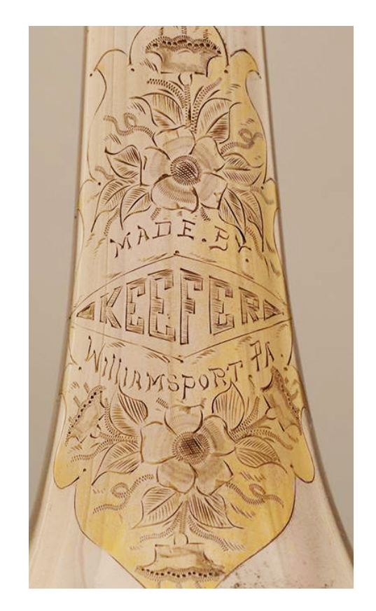
Style 3: large "KEEFER" in center [by Charles Otto]